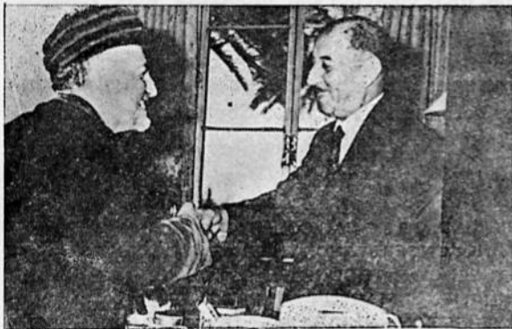
His Excellency Ahmed Hassan al - Baker, President of Iraq receives His Holiness.

In a statement to the Iraqi News Agency the Patriarch thanked the Revolutionary Command Council, with President Ahmed Hassan al-Baker at the top for restoring to him his Iraqi nationality.