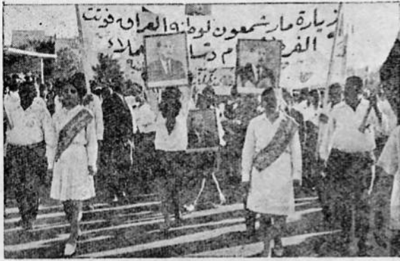
Procession to the Presidential Palace

He added: "I should call upon all Assyrians in Iraq to give every boost to the revolutionary regime and devote themselves to serving their homeland."