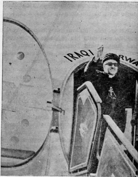
Arrival in Baghdad by Charter Plane specially sent by His Excellency Ahmed Hassan Al - Baker the President of the Republic of Iraq.

While His Holiness was with the President a message was handed to His Excellency to the effect that thousands of Assyrians were on their way to the Palace anxious to express their gratitude to the President and the Iraqi Government for inviting His Holiness to visit his people