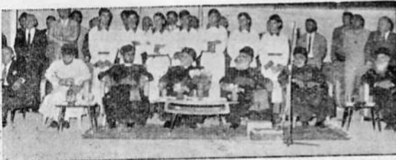
With the Boys' choir at Kirkuk - The Metropolitan and the Bishops are also seen in the picture.

It should be mentioned here the Mustafa Barzani, the Kurdish leader had also extended through Kurdish Ministers in Baghdad a warm invitation to the Patriarch to visit Kurdistan, and several prominent