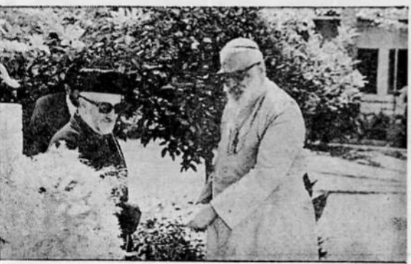
With the Syrian Catholic Bishop.