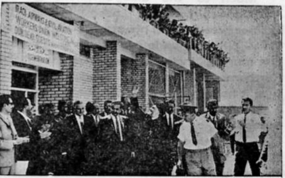
Departure from Baghdad

In view of the indisputable facts, which have been presented in this article, it is hoped and prayed that the World Church Council even though not in consideration