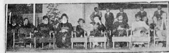
His Holiness and the Prelates of the Church at a Tea party at the Assyrian Club, Baghdad.

His Holiness was deeply moved by this gracious offer of His Excellency but had sadly to decline it because of the fact that preparation for the celebration of the occasion in the city of Chicago had been going on for nearly a year.