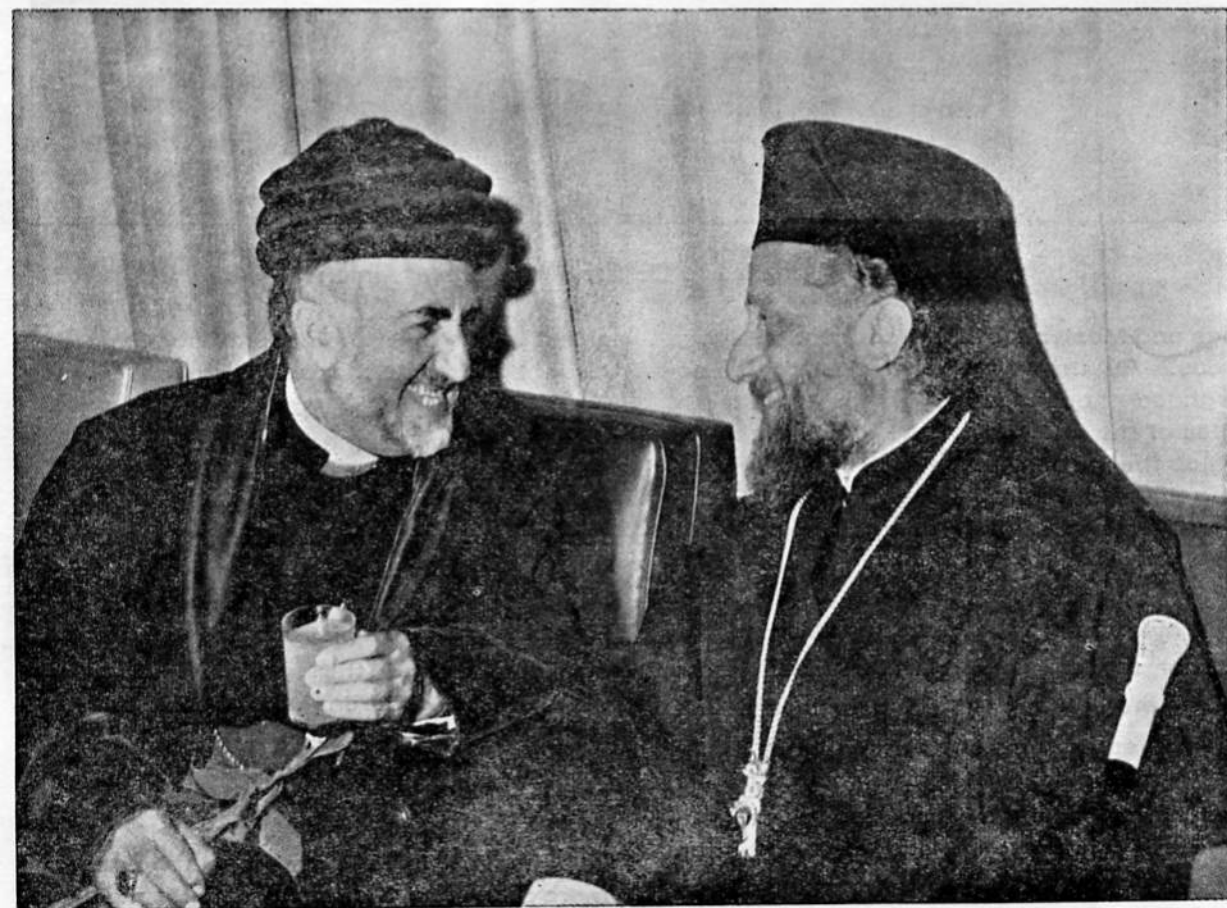
With the Greek Orthodox Bishop