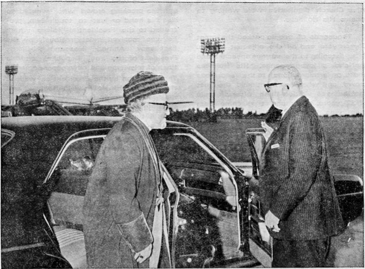
His Holiness being led to the Car at the Beirut Airport.

ities and Moslems of Baghdad, and outlying areas. All the way from the airport to Baghdad thousands of persons lined both sides of the road, and His Holiness' car, in which the Acting Minister of Interior was also riding, was practically mobbed by the joyous crowd, who mingled tears with laughter.