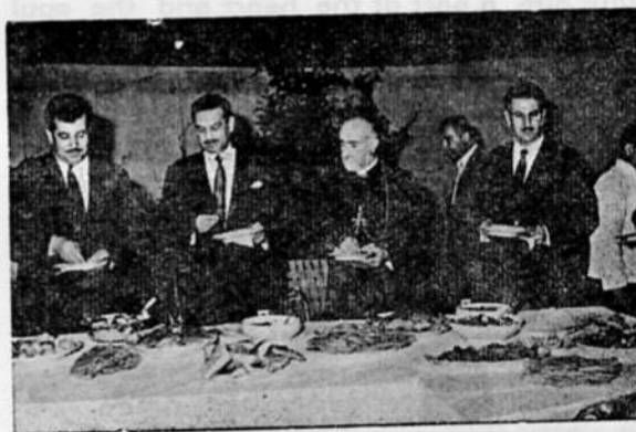
The Patriarch dining with the Ministers.

comments are typical of the publicity given to this historic visit of his Holiness. The Baghdad Observer English language daily paper, under the title: "Grateful to Baker