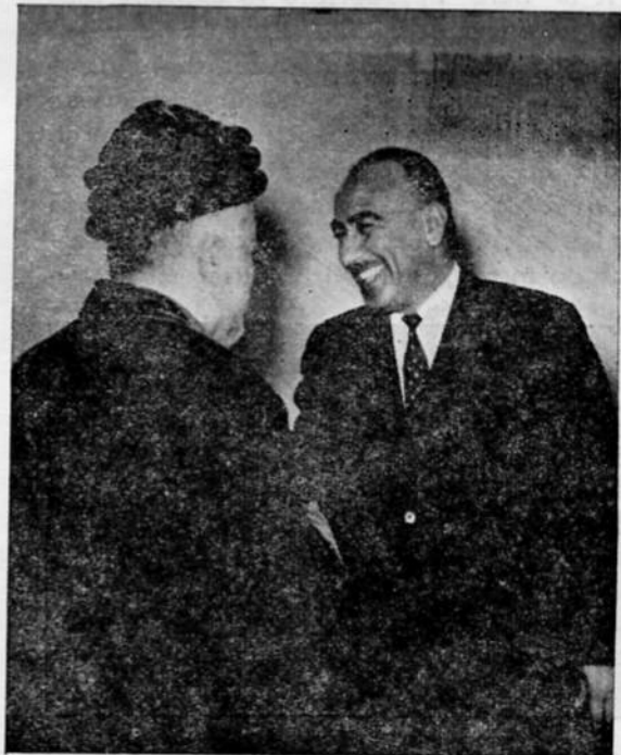
His Holiness being received by the Representative of the President of Iraq.

During the one month stay in this house, His Holiness received thousands of Assyrians. It was not uncommon to