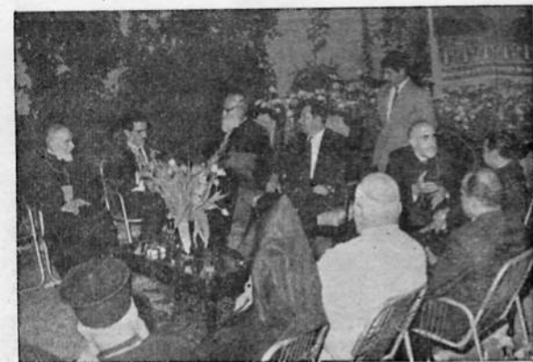
Talking to Bishops and Baghdad dignitaries.

ment. It will be recalled that the revolutionary Government has restored to the Patriarch his Iraqi citizenship which was withdrawn from him in 1933 under the exterminated imperialistic-monarchic regime."