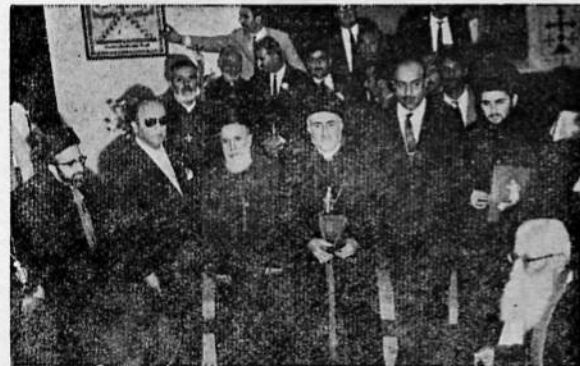
Reception at Mar Zaya Cathedral - standing to the right of His Holiness is Mar Paulos Shekhau the Chaldean Uniate Patriarch.

Despite all these endless engagements, which would start at 8-30 a. m. in the morning and end at 11 or 12 midnight, His Holiness gave several hours to the discussion of the most important affairs