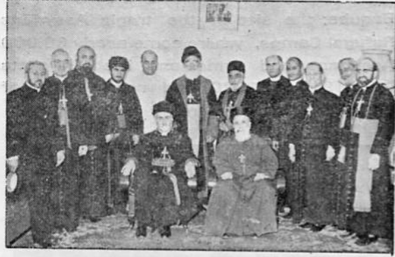
His Holiness with the Chaldean Uniate Patriarch and some of the Prelates.