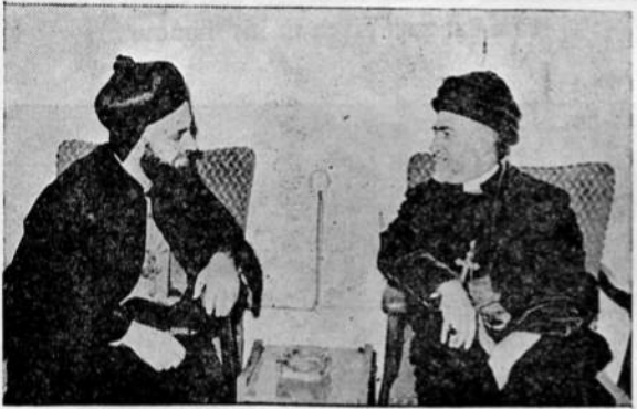
With the Syrian Orthodox Bishop.