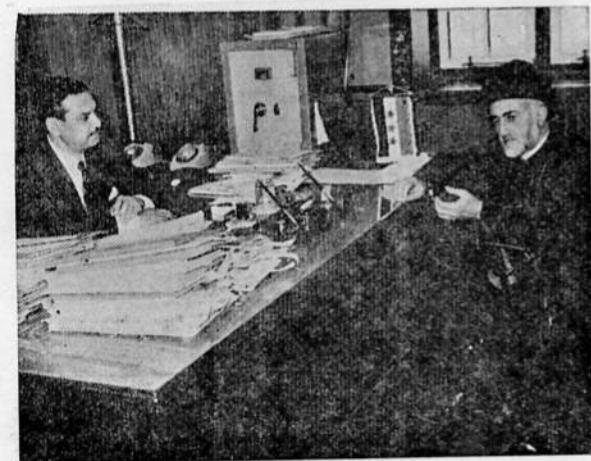
In conversation with the Minister of Interior

His Holiness' visit to Iraq was widely and favourably commented on thro-