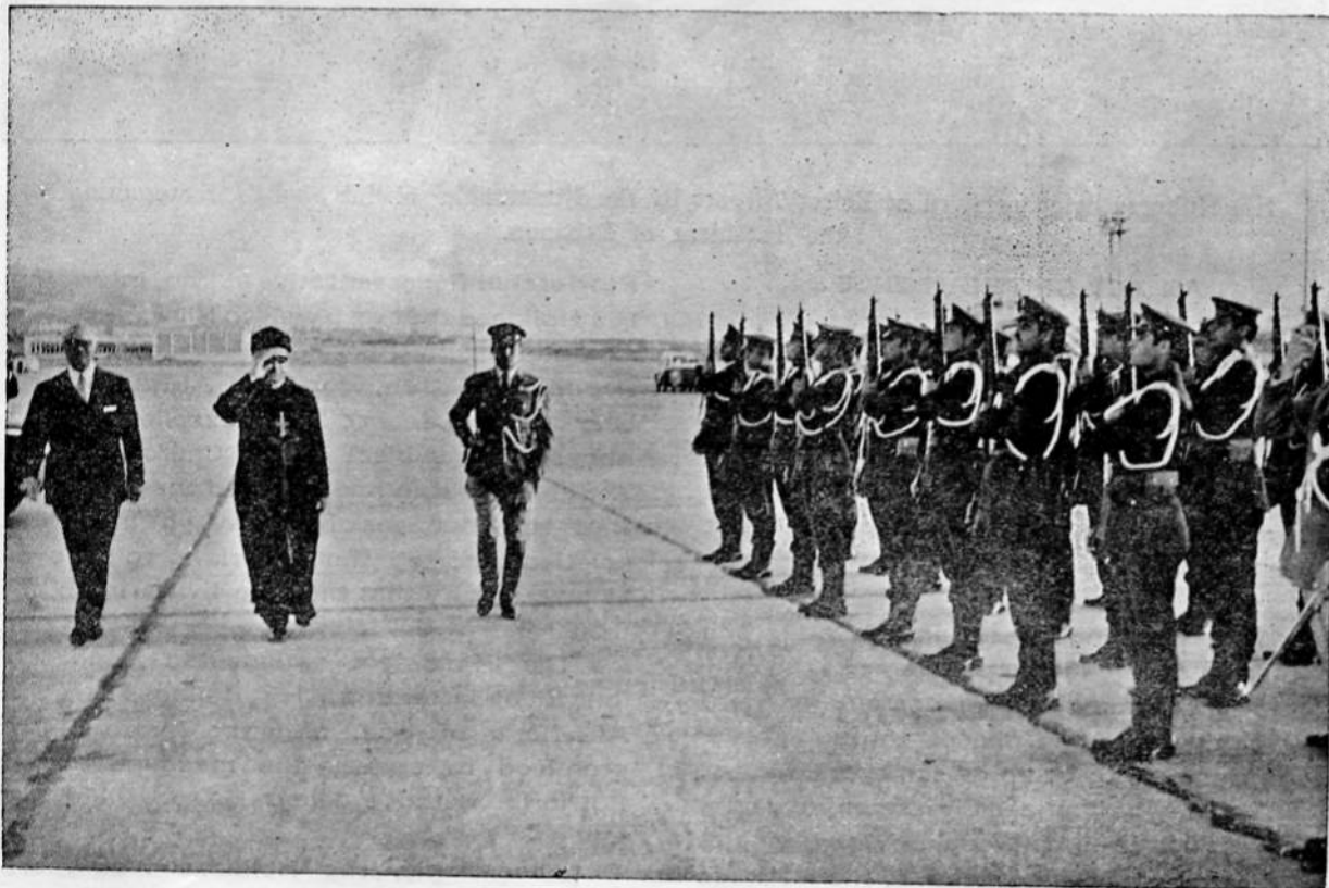
His Holiness inspecting a Guard of Honour at Beirut Airport

Wednesday, April 22, His Holiness arrived in Beirut, Lebanon, at 6 p. m. and where he was received by the Honourable