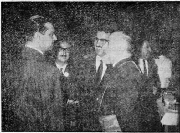
With the Honourable Minister of Interior, Iraq.

Churches. This was the case also with the Moslems and Hindus during His Holiness' historic visit to the Church in India.