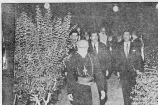
His Holiness leading Ministers and Church leaders to a banquet given in his honour.

Tikret and Samara, and finally the city of Baquba; the site of the tragic Assyrians Refugel Camps, where some nearly 80,000 Assyrians and Armenians lived in tents from 1918 to 1920, and nearly 9,000 of them were buried there.