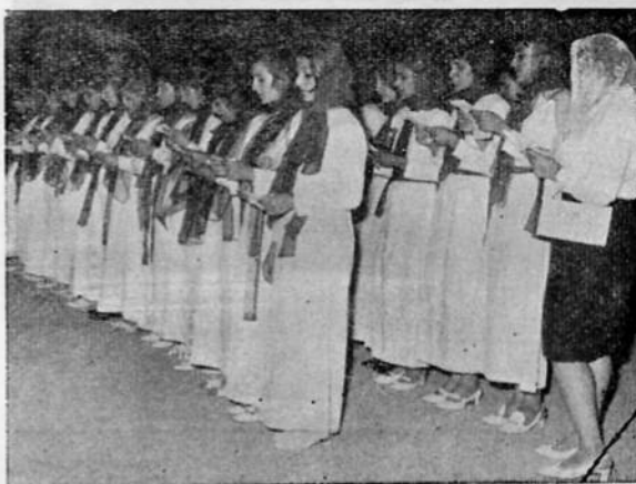
The girls' choir at Kirkuk.

ughout the countries of the Middle East. It was considered nonpolitical and a redress of a great injustice perpetrated upon His Holiness thirty-seven years ago, and thereby on the Church of the East and the Assyrian people and whose good name had been unjustly besmirched. The following