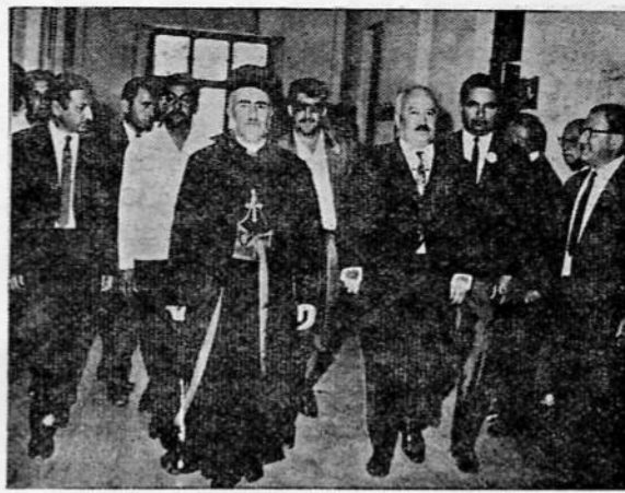
His Holiness being received by the Governor of Babel

of the injustice committed in flagrant violation of all ethical and legal standards against the Church of the East, but rather in respect and consideration of the member Churches of the World Council and the public in general, who had been misled by their previous reports, will now issue another statement stating the true facts without bias or rancour.