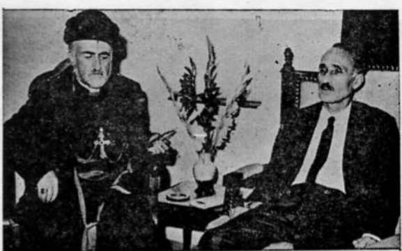
With the Kurdish Minister

in the Middle East and, though, as is well known the Iraqi Government released information for world press (presumably via Reuter British newsmedia since that is the only major international network in Baghdad) yet, not a word has been written about it in the Western Press.