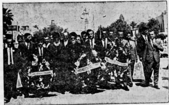
Laying wreath on the unknown soldiers' Tomb.

With one single stroke, the present Iraqi Government swept away a terrible injustice perpetrated against His Holiness, the Church and the Assyrian people, so long ago, and thereby restored to them their freedom