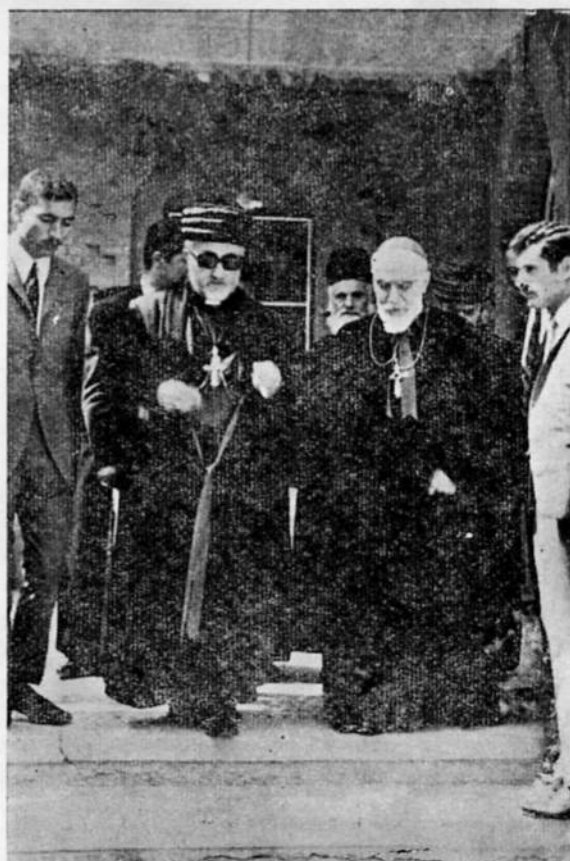
With the Armenian Catholic Bishop.