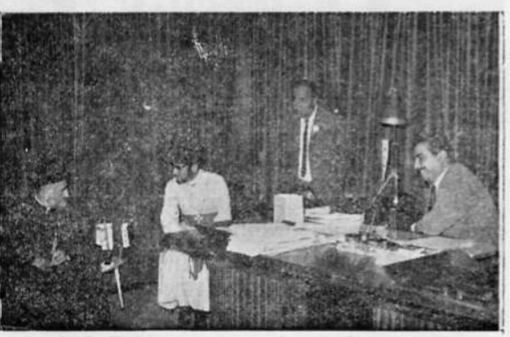
With the Governor of Kirkuk.

in the Middle East and, though, as is well known the Iraqi Government released information for world press (presumably via Reuter British newsmedia since that is the only major international network in Baghdad) yet, not a word has been written about it in the Western Press.