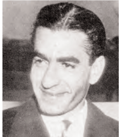
SHAH OF IRAN GREET'S PATRIARCH - PROMISES AID -