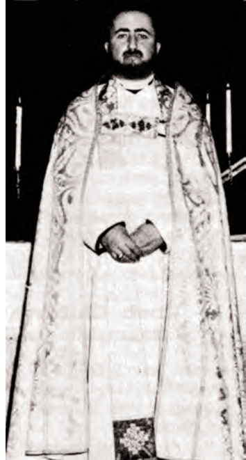
His Holiness Mar Eshai Shimun XXIII

minor grades of the hierarchy, and a week afterward was consecrated to the supreme office of Patriarch, as the one-hundred and nineteenth in direct apostolic succession from St. Peter, St. Thomas, St. Thaddeus and St. Mari, one of the Seventy.