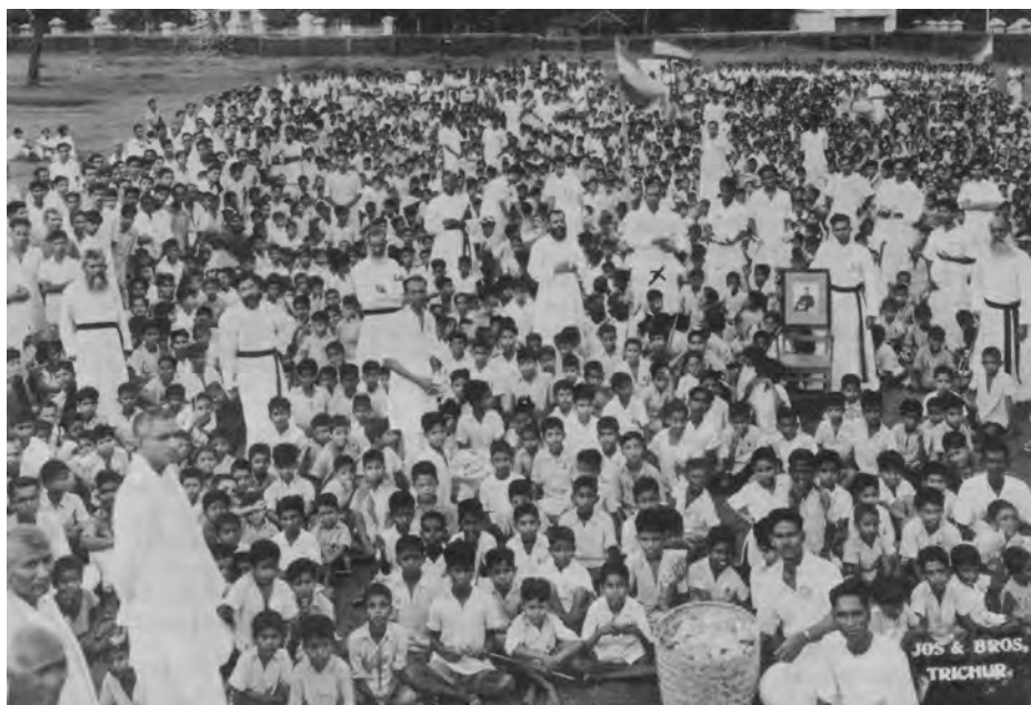
procession celebrates Patriarch's Jubilee.

Bright sunlight, breaking through the midst of the monsoon season of heavy rains, blessed the day of the jubilee at the Cathedral Church of India at Trichur, honoring the thirtieth anniversary of the consecration to the Patriarchate of Mar Eshai Shimun XXIII.