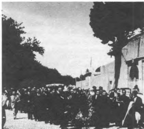
Assyrians in Iran take part in Funeral of late Emperor, Riza Shah Pahlevi