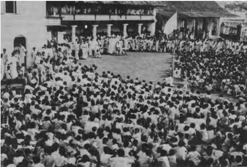
The mass meeting conducted in courtyard of the cathedral church.