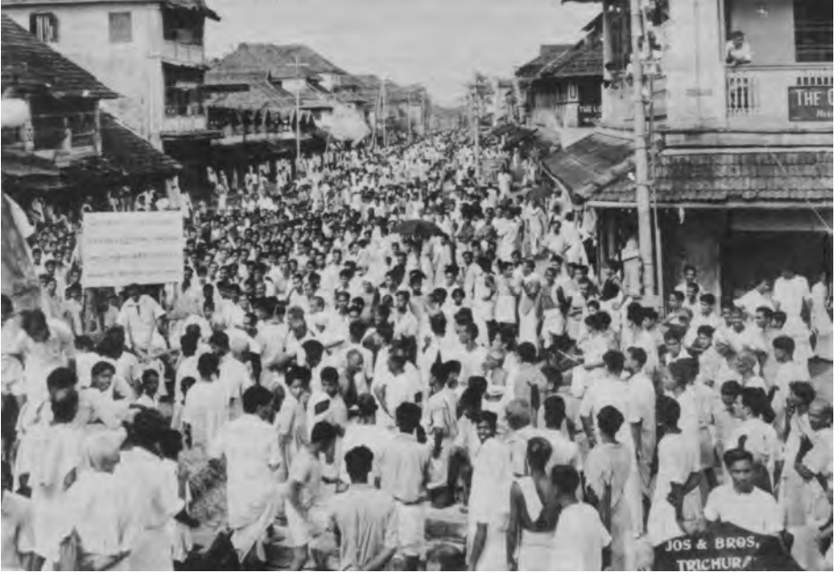
Church of India in mile-long