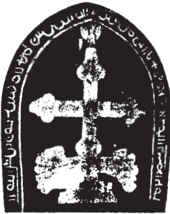
Persian Cross on tomb of Mar Jacob, Alangatt, India, showing descending dove and two rivers at base of cross. Inscription is in ancient Persian Language.

It is true that the Church of the East does not use, nor permit, statues in its churches. This, however, is customary in Buddhist tempels. The tribute thus paid to Mar Toma by the imperial Prince of Japan shows, according to Buddhist scholars, that the Japanese at that time regarded Mar Toma as an embodiment of the Divine Light. This is the significance of "Bodhi".